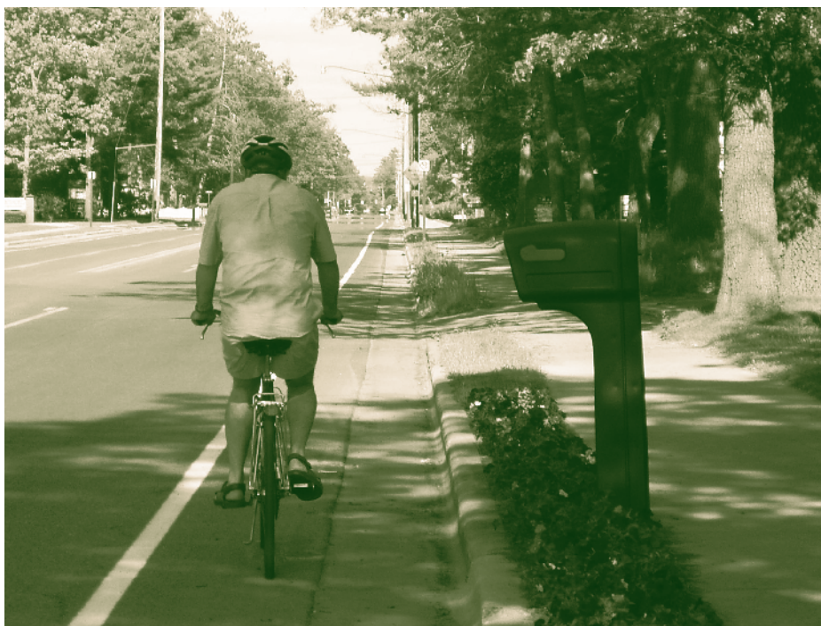
Complete streets are designed to be comfortable for pedestrians, bicyclists, motorists and transit riders.

The connectedness of our trails to our streets and sidewalks is what will make the trails more accessible to more people trying to make their way around the region. It's about choices – the confidence in letting your children ride or walk to the park or you choosing how you commute to work. It's about empowering the people of our community to choose how they want their community to look, feel, and function today and in the future.