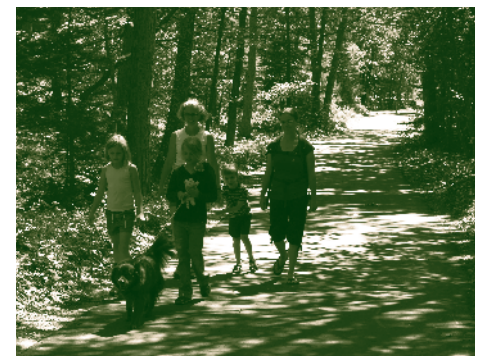
A trail for generations.