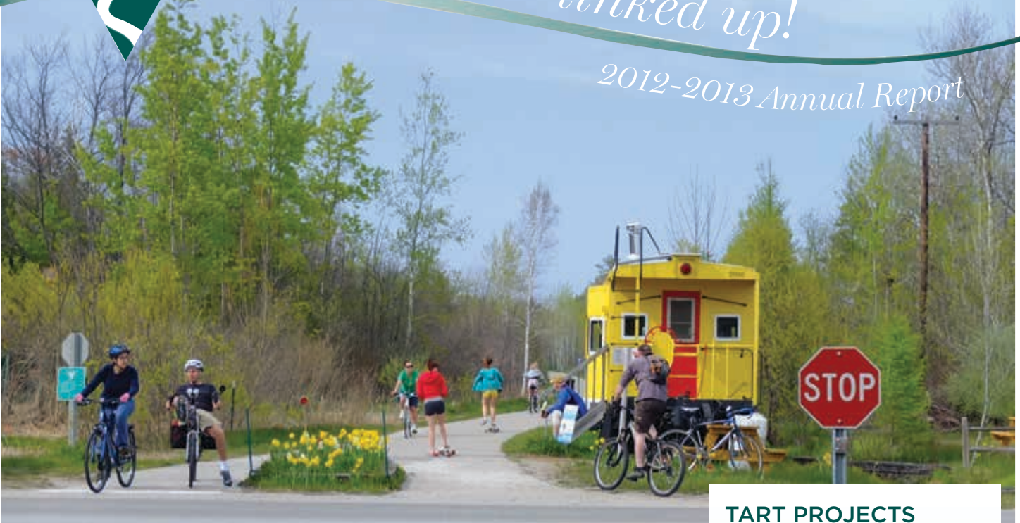
The Leelanau Trail bustles with activity on a warm spring day.