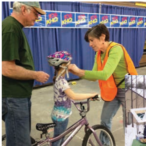
Trail Ambassadors teach kids cycling safety during a bike rodeo.

Smart Commute had 62 teams composed of 1,088 people competing in the weeklong challenge in June. An estimated 24,250 miles were commuted 'smartly' during the week, saving 9 tons of CO2 emissions.