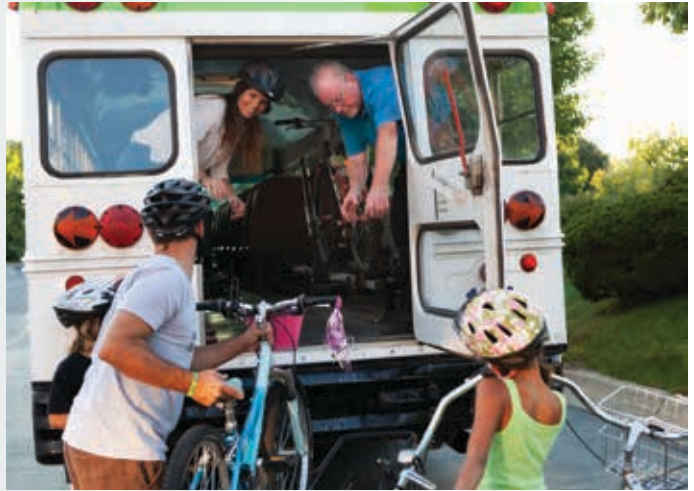
After riding the Leelanau Trail, a family hops on BATA's Bike-n-Ride bus.

On summer days you'll find the Leelanau Trail filled with people enjoying the sights and sounds around them. Since the paving project was finished, there's been a noticeable increase in use, bolstered by recognition in several publications as a top destination and premier trail in the state. Not everybody has the desire, endurance, or time to ride the trail both directions. What to do? Enter BATA's innovative Bike-n-Ride program. Through the summer,