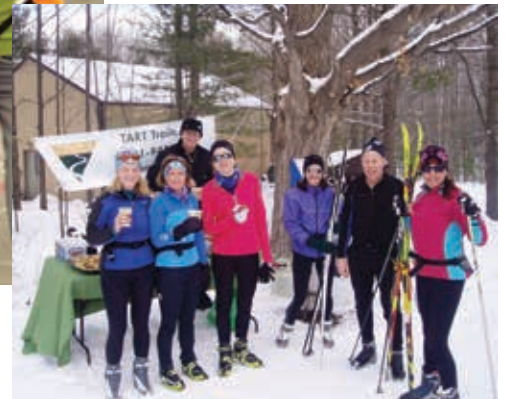
Skiers enjoy freshly groomed trails provided by TART's Grooming Program.

When the snow falls, a volunteer Trail Grooming crew grooms 14 miles of the Leelanau Trail weekly for trail users. Under a contract with the DNR, the Vasa grooming crew regularly grooms more than 25 miles of the Vasa Pathway to provide pristine conditions for novice and competitive skiers. Combined, more than 1,000 hours