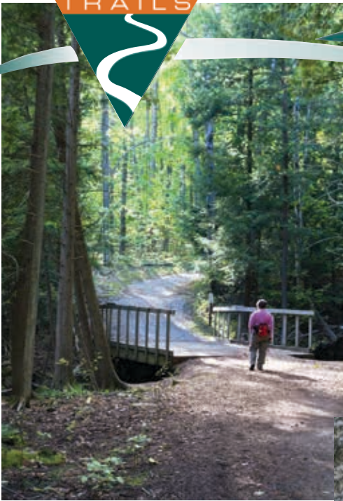
A hiker takes in the serene beauty of the Vasa Pathway.

The Vasa Pathway is a world-class cross-country ski destination.