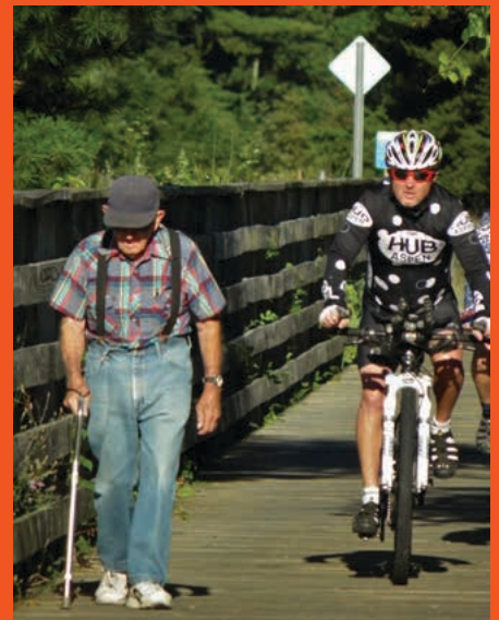
Trails provide opportunities for everyone to enjoy outdoor recreation.